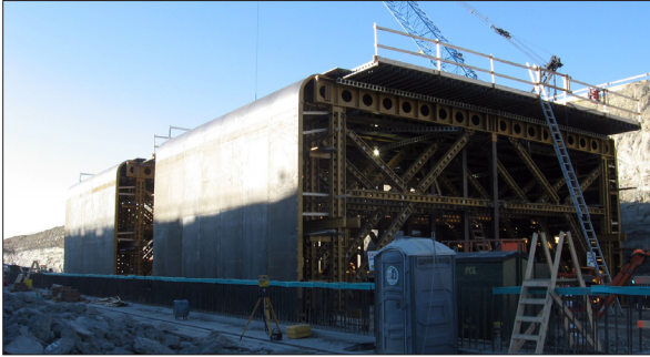
View of the tunnel formwork