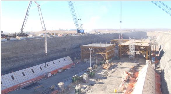
View of the tunnel looking west